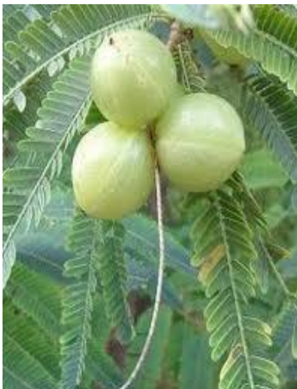
Fig 1: Amalaki fruit and leaves

Amalaki seed contains fixed oil, phosphatides and a small